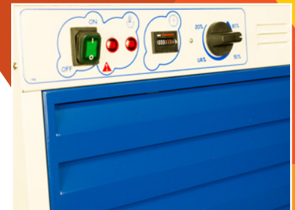
SIMPLE CONTROL PANEL

PROUD TO BE 100% NEW ZEALAND OWNED & OPERATED