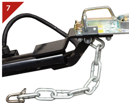
Safety Chain & plug Socket Standard